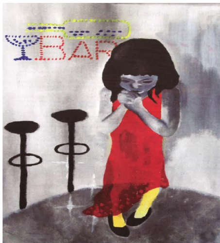
Reed & Latino "I have a voice: Trafficked Women in their own words". 2015.