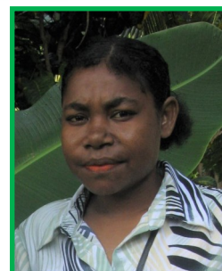
Contributed by Jacinta Garry, Papua New Guinea