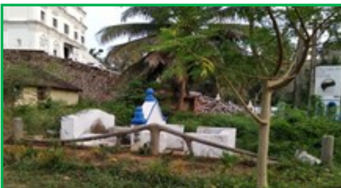
A barricade made by Prazeres with recycled plastic bottles and a little cement.

Being a keen reflective observer, he notices things when done differently. He noticed our circular seating arrangement and values the fellowship of face-to-face conversations with respect and equality. We took part in the yearlong reflections on Laudato Si’ and followed up