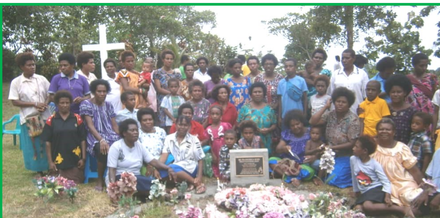
Friends of Nano Christmas Hospital visit.