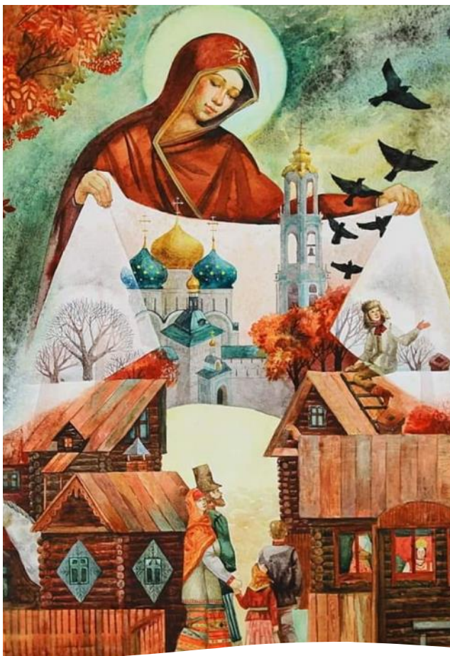
Image: Mary holding a protective veil, as an echo of the Pokrov apparition, on October 1, 911.

(This is an extract from an article by journalist Austin Ivereigh, for 'Where Peter Is'. See The Pope's Clear Position on Ukraine - Where Peter Is to listen to or read the full text of the piece).