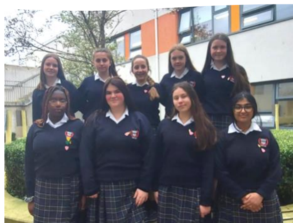
Image: Members of the 'Cairde Nano' Team (Scoil Chríost Rí, Portlaoise).