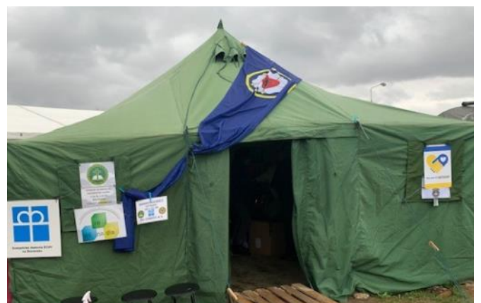
Image: Donor Tent at Slovakia-Ukraine border.