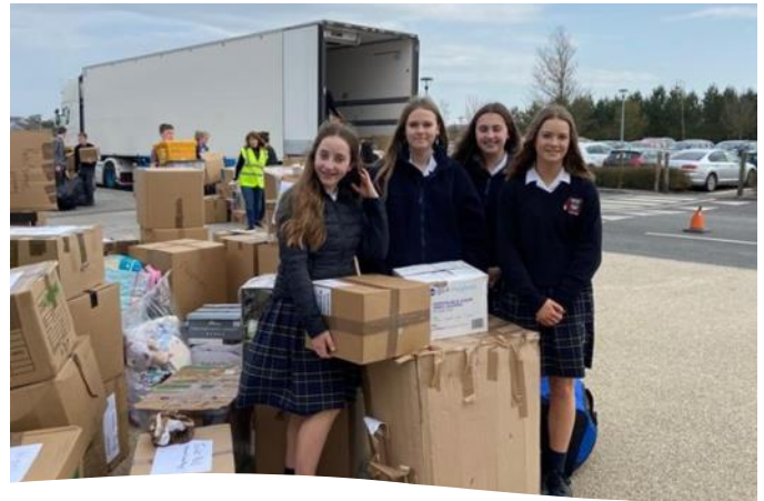
Image: Some of the 'Cairde Nano' Team (Portlaoise) help to load supplies.