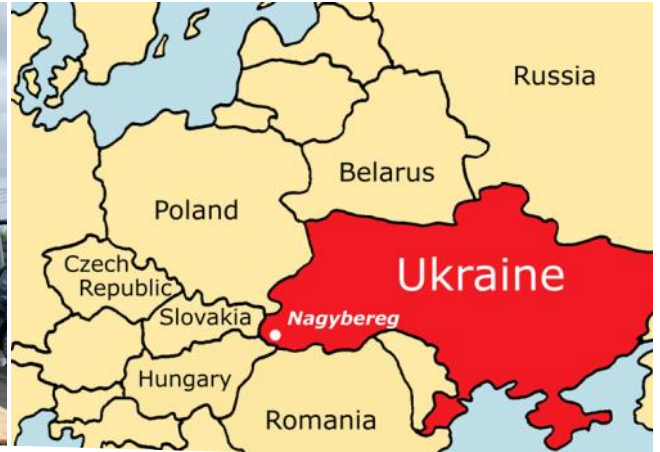
Image: At the border between Slovakia and Ukraine.