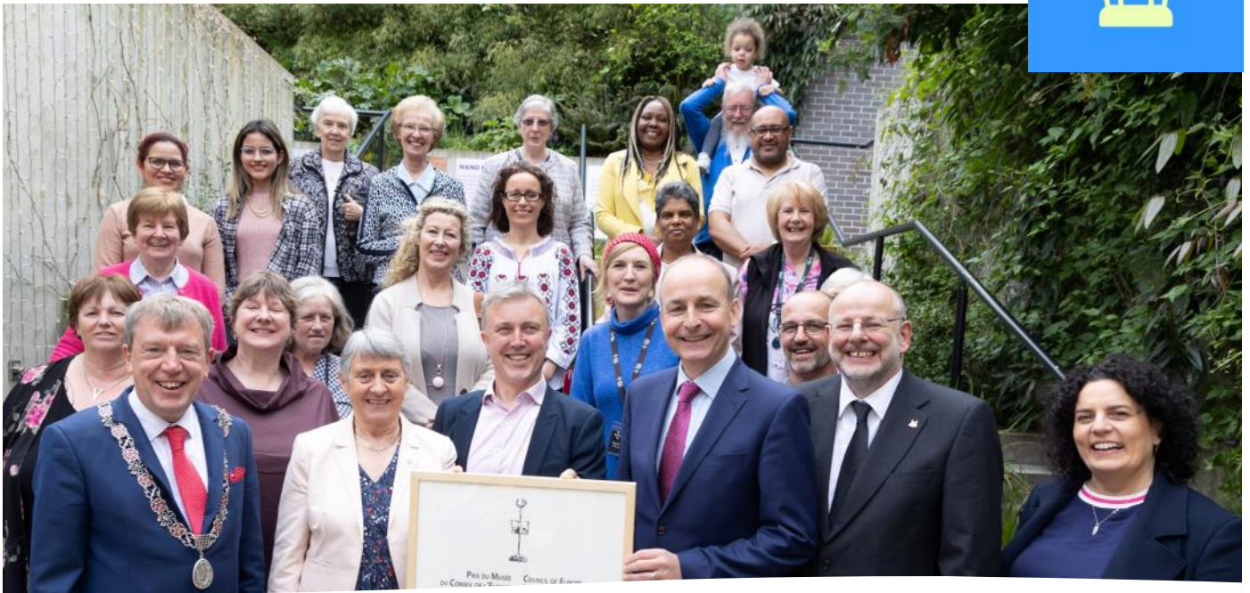
Image: Celebrations with An Taoiseach, Micheál Martin at Nano Nagle Place.