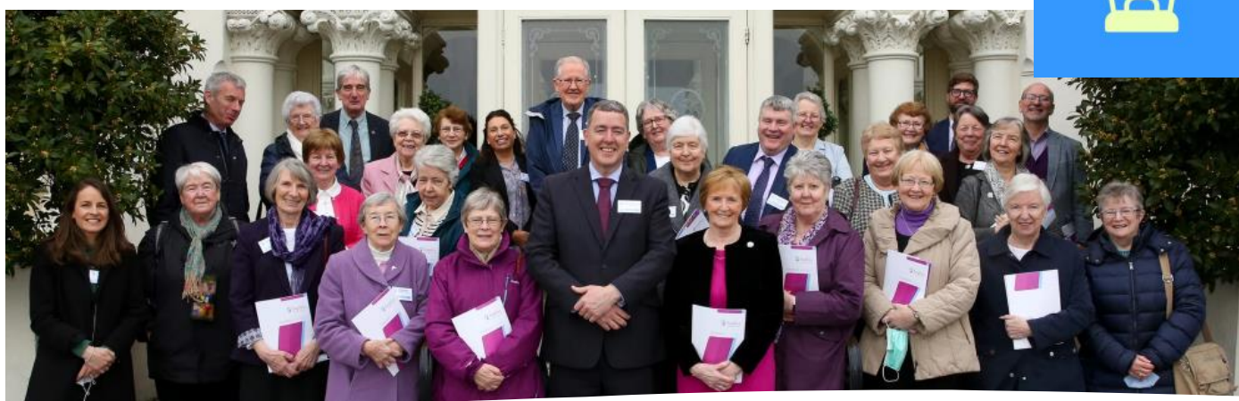
Image: Sophia started their celebration of 25 years of providing homeless services, joined by of the Religious of Ireland.